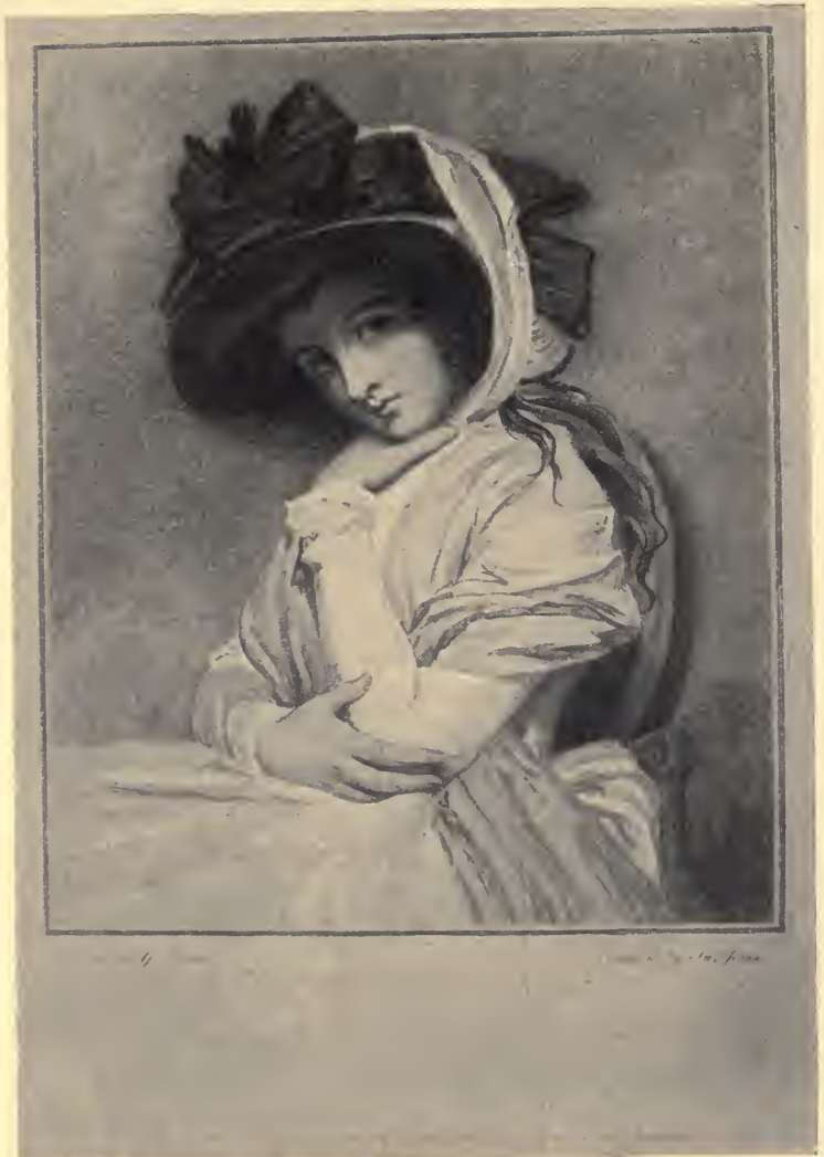
JOHN JONES. EMMA, LADY HAMILTON, AFTER ROMNEY